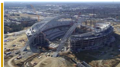
Texas Stadium under construction